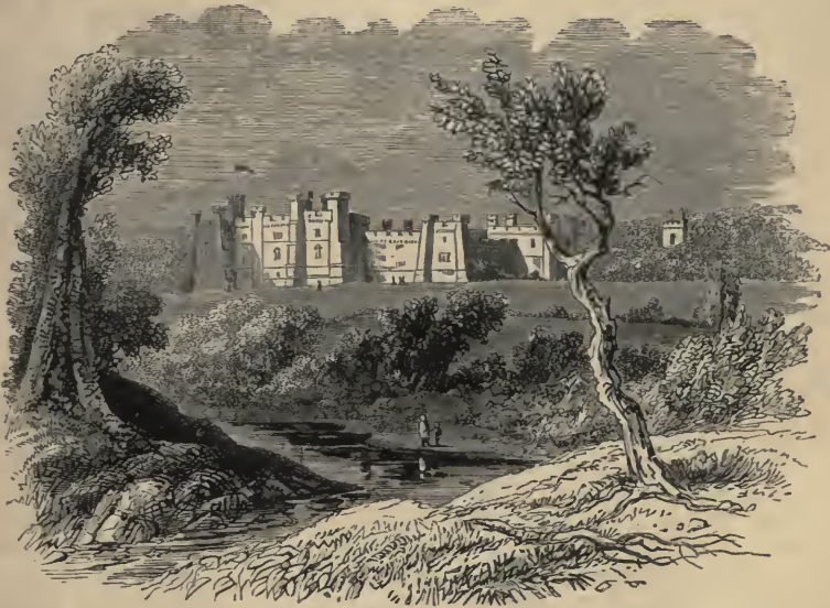
BRANCEPETH CASTLE. From an Original Drawing.